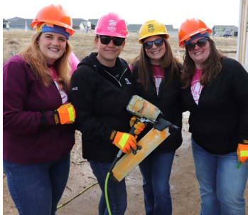
Hope Builders Luncheon