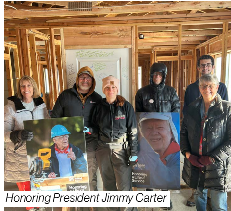
Honoring President Jimmy Carter