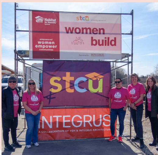
Current members of the Women Build Steering Committee volunteering at the spring Women Build event in March.

Habitat for Humanity-Spokane is seeking passionate and dedicated women from diverse backgrounds to join our Women Build Steering Committee . Whether you work in construction, real estate, community service, healthcare, or simply have a heart for making a difference, we invite you to bring your unique perspective and talents to our mission. As a Steering Committee member, you'll play a vital role in organizing and sustaining year-round Women Build programming, including volunteer events, fundraising efforts, advocacy campaigns, and networking opportunities . Together, we're building more than homes—we're building equity, empowerment, and lasting community impact.