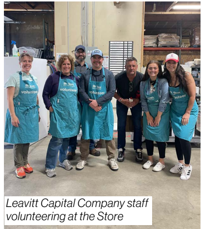
Leavitt Capital Company staff volunteering at the Store