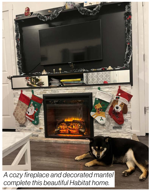
A cozy fireplace and decorated mantel complete this beautiful Habitat home.