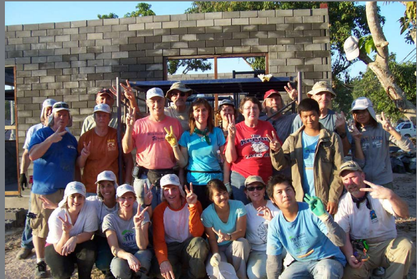
Volunteers from Habitat-Spokane at the Thailand Carter Build, November 2009.