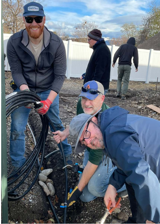
Volunteers working at N Collins Lane in Spokane Valley

Deer Park: Our team has wrapped up most exterior tasks and is now diving into exciting indoor projects, including both new construction and renovation! With the chilly weather settling in, we're thrilled to be working indoors, making the job experience a whole lot cozier for everyone.