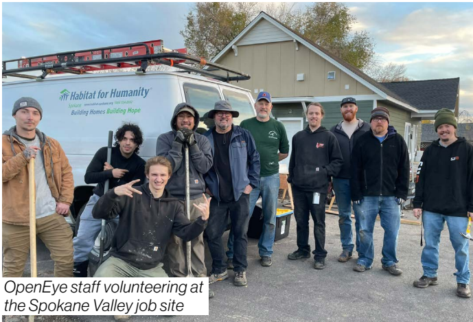
OpenEye staff volunteering at the Spokane Valley job site

habitat-spokane.org/volunteer-opportunities