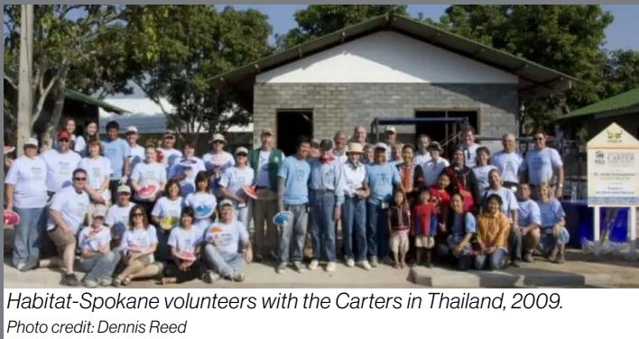
Habitat-Spokane volunteers with the Carters in Thailand, 2009.

Habitat-Spokane joins Habitat organizations around the world in erecting a memorial door to pay tribute to the late President Carter and acknowledge how his efforts opened doors to brighter futures for thousands of Habitat homeowners for more than four decades. We will be celebrating President Carter's life of service in the coming weeks with a memorial door event where the general public will be invited to pay tribute by signing their name and a personal message. We will also be hosting a local build event in late May 2025.