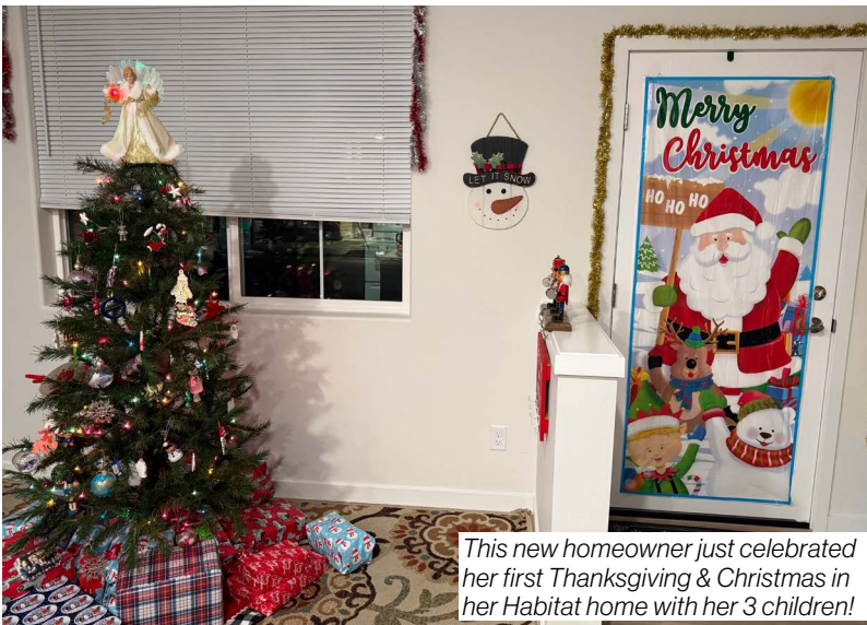
This new homeowner just celebrated her first Thanksgiving & Christmas in her Habitat home with her 3 children!