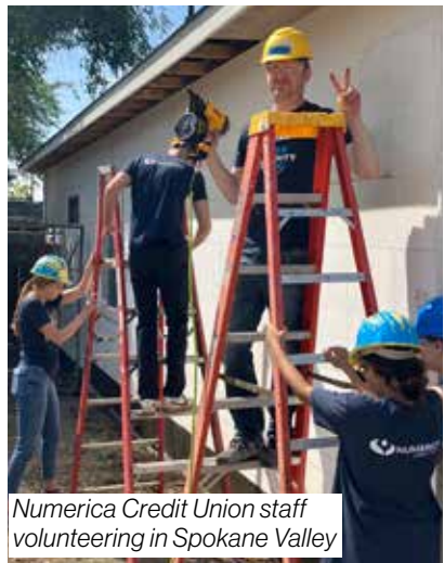
Numerica Credit Union staff volunteering in Spokane Valley