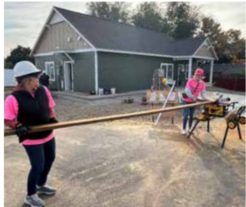
Women Build 2 in October took place at N Collins Lane, with the first home (pictured here) ready for interior work.

Volunteer opportunities will be available at both the Deer Park and Spokane Valley job sites for the remainder of the year, with the highest need for volunteers in Deer Park.