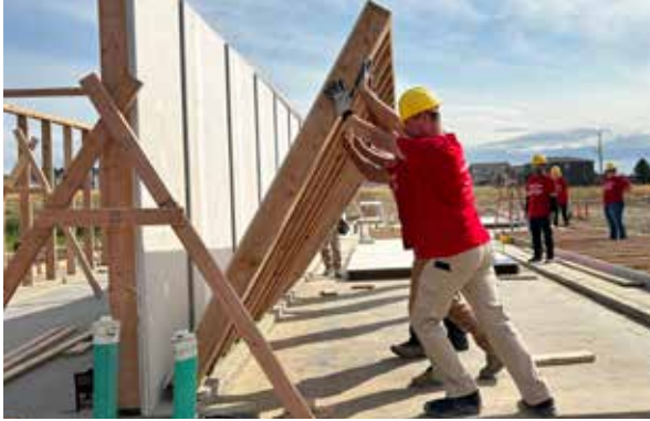
Volunteers raising a wall at the last two homes on Margaret Street in Deer Park during Veterans Build in September.

the year. Our dedicated construction team aims to have the two units on Margaret Street roofed, sided, and ready for interior work over the winter. This progress is a testament to the collective effort and support from our community.